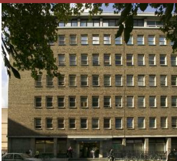
Institute of Archaeology UCL