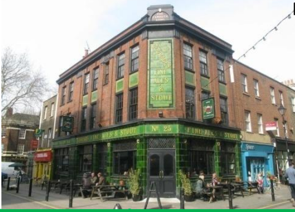
Exmouth Arms Pub