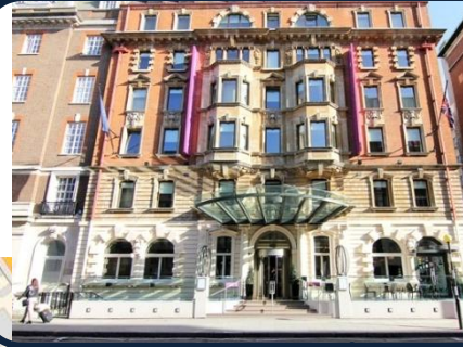
Ambassadors Bloomsbury Hotel