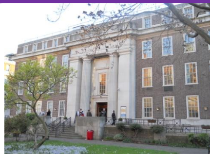
Friends House Main Venue